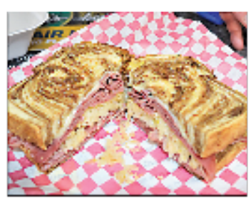
Check out their lineup of oither great sciedtions.

Monday-Friday 7am-9pm Saturday 9am-9pm Sunday 10am-4pm