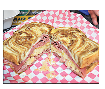
Check out their lineup of other great selections.

Monday-Friday 7am-9pm Saturday 9am-9pm Sunday 10am-4pm