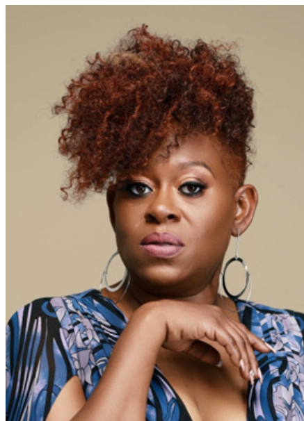
Shonka Dukureh