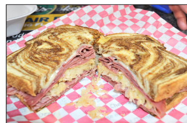
Check out their lineup of other great selections.