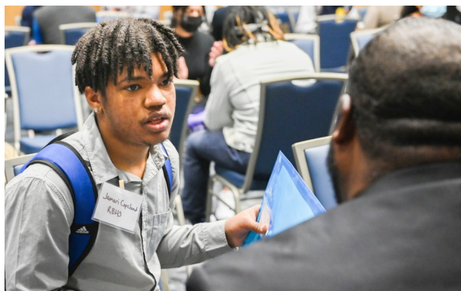
Students from Hamilton County high schools mingled and passed out business cards during a speed-networking event last Thursday at the University of Tennessee at Chattanooga.

CEO of the group, is to inspire students and expand their vision of what's possible for their education, their careers and their future in general.