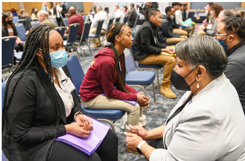
High school students work the room at a speed-networking event last Thursday at the University of Tennessee at Chattanooga.