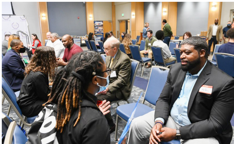
About 70 students from Hamilton County high schools met with 40 business professionals at a speed-networking event last Thursday at the University of Tennessee at Chattanooga.