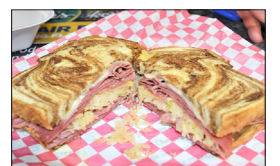
Check out their lineup of other great selections.

Monday-Friday 7am-9pm Saturday 9am-9pm Sunday 10am-4pm