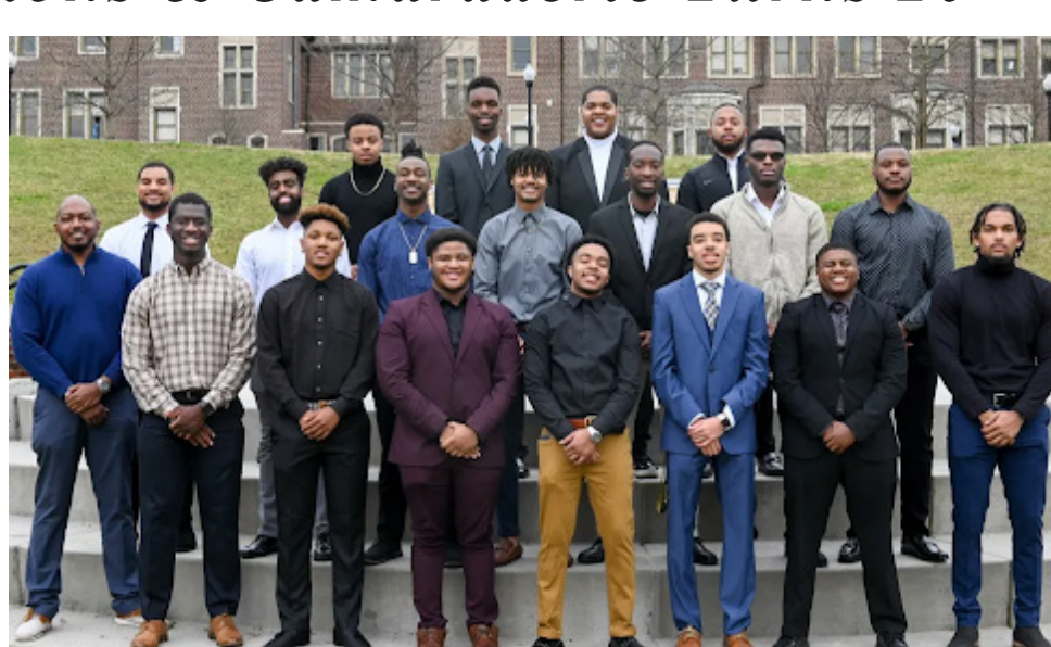
Campus leaders from African Student Association, Alpha Phi Alpha fraternity, Black Student Alliance, Brother 2 Brother, Kappa Alpha Psi fraternity, Multicultural Center's Guide Mentorship Program, National Society of Black Engineers and UTC NAACP gathered for a Chamberlain Field photo session Feb. 24, 2022. For entire story, visit https://blog.utc.edu/news/2022/02/a-safe-spacefor-conversations-and-camaraderie-turns-10/

When those young men are together, there's a level of transparency, comfort and familiarity," he said. "It's men from all different backgrounds, typically African American, some Hispanic, biracial, multiracial, young men of color. They get to share their experiences and commonalities in a space where they can just be comfortable.