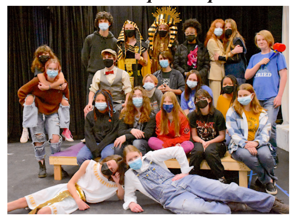
Chattanooga High Center for Creative Arts "Epic Proportions" cast members.