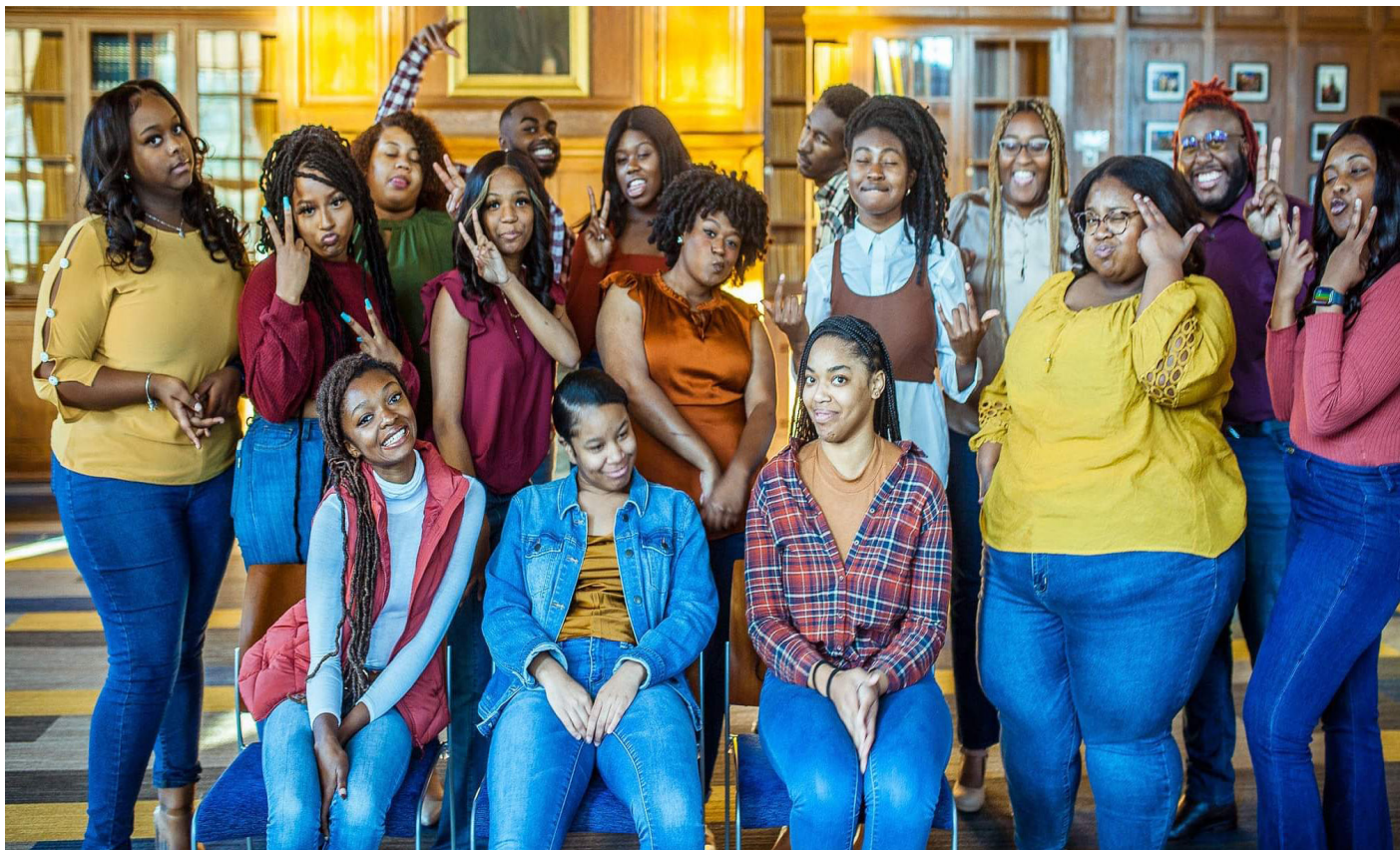
The Littleton H. Mason Singers will headline Chattanooga's annual MLK Day of Service. The COVID-Conscious service will take place on Jan. 17.

City Hall will serve as a collection point for donations to benefit organizations located in the ML King Boulevard and 11th Street area. Residents can either walk up or drive up to drop-off their donations from 8:30-11:30 a.m. on Jan. 17. Beneficiaries will be: White-side Faith Manor, Arts Build, The Community Kitchen, the Maclellan Shelter for Families and residents